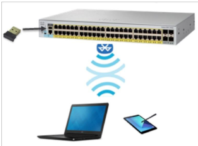
Figure 2. Over-the-air switch access using Bluetooth